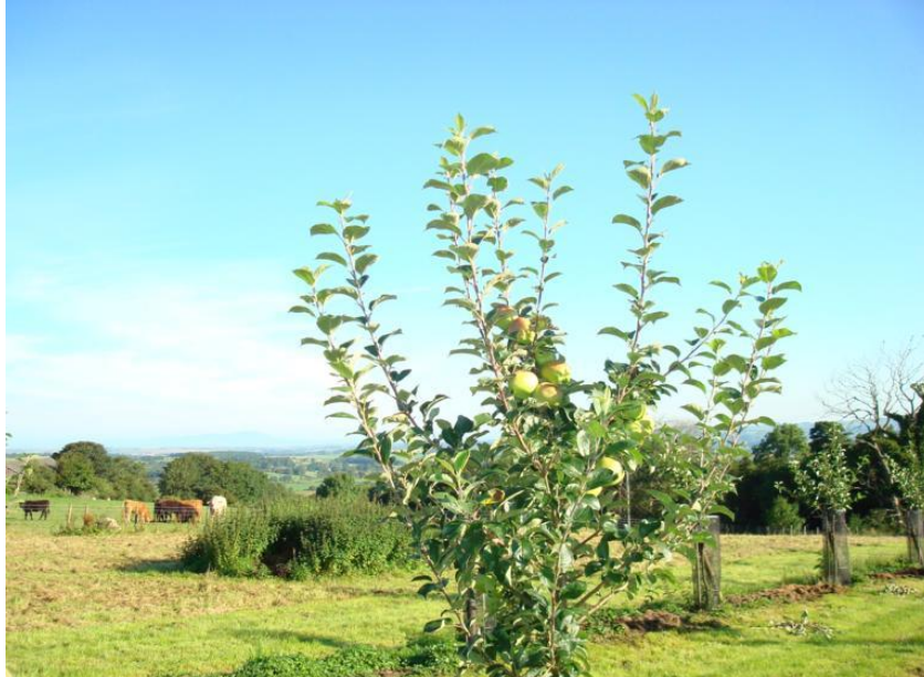
Figure 12 - Keswick Codlin 2010. The leader was summer-pruned out, but only down as far as the apples!

The idea in planting fruit trees is to get fruit. I tried to ignore this for the first year or two, assiduously