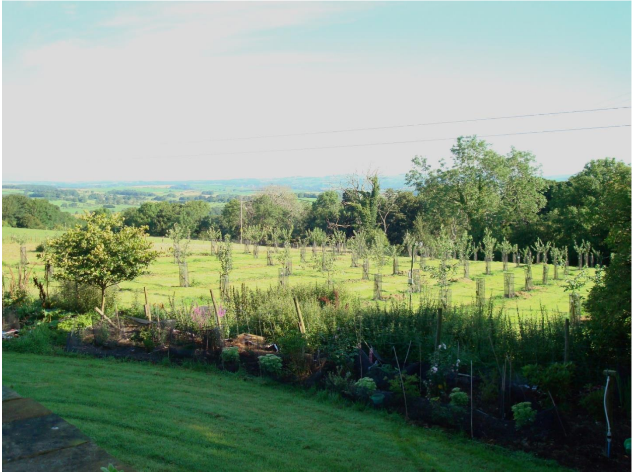
Figure 1- The orchard looking North, August 2010