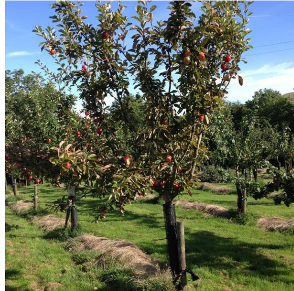
Figure 7 - Strangled Katy in 2015 after most of the early crop had fallen (note the off-colour leaves)

I had quite a bit of bother with rubber tree ties breaking – particularly in strong winds. There is nothing quite as useless as something that fails just at the moment when it needs to function most, so I replaced the ties with some stout plastic rope. This is particularly unyielding and very effective at cutting into the bark as the tree grows so you do have to remember to check them every year. Needless to say, I failed to do this and successfully managed to strangle a Katy in 2015 (see Figure 7), with the result that it produced a huge and early crop as it clearly thought it was about to die (and may be right!).