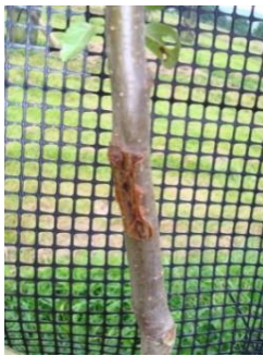
Figure 4 - Papery bark canker on Fiesta

Six years on, it is clear the some varieties are doing better than others. Initially, the biggest disappointment was the Fiesta. After planting it, I read in "The Fruit Garden Displayed" that it is "prone to toxicity and canker on acid soils less than pH 6". I can testify to this. Most of my Fiesta was hit by a severe form of peeling, papery bark canker (see Figure 4).