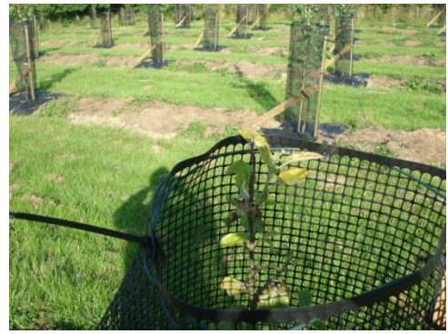
Figure 11 - Sick Sunset after spray

In the second year I decided on a slightly different approach, sowing a green manure crop of clover in some strips, planting potatoes others and putting weedkiller on the rest. The clover was pretty but was out-competed eventually by creeping buttercup. The potatoes were excellent and untouched by the rabbits. The weedkiller worked as before but with an unpleasant side-effect in that a number of trees (mostly the Sunset – see Figure 11) were affected by spray drift. Quite why this happened is a bit unclear as there was virtually no wind when I sprayed. I can only think that, since the spray was applied shortly after taking off the rabbit guards, the bark was still fairly green and tender and thus more susceptible than otherwise (of course the previous year, the rabbit guards would have protected against spray drift). The net result was that the affected trees' leaves went yellow and they stopped growing. Thankfully they started to recover the following year.