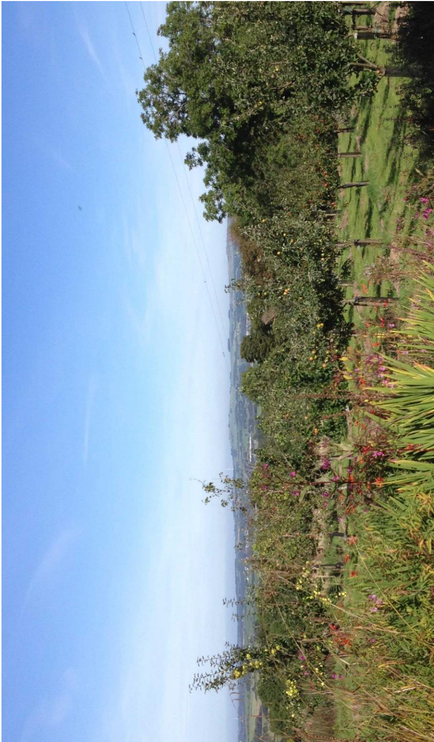
Figure 13 - The Orchard in September 2015