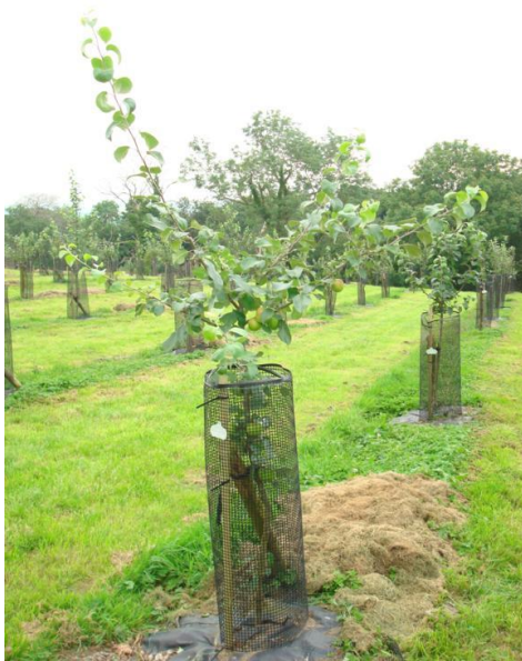
Figure 6 - Lane's Prince Albert in 2010

Then, alas, it got bad canker – but it took bad management to finish it off (see “Protection” below). See the Appendix for more details on the performance of the different apple varieties. As regards the plums and pears, there wasn't half as much science in the selection – more a question of getting a variety of ripening periods, cross-pollination and some chance of coping with the conditions. I settled on a Damson (Shropshire Prune), Marjorie's seedling plum, Greengage (some hope!), Rivers' Early Prolific plum, Hesse pear, Concord, Williams Bon Chrétien, and Conference. All except for the Conference grew OK but only now are they starting to yield much fruit. The Conference had the wettest spot in the orchard, next to the beck and died from canker.