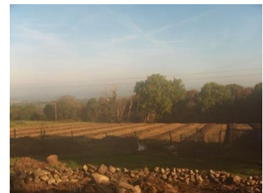
Figure 3 - Newly ploughed orchard

I had discussed these plans with my neighbour, a farmer who had been keeping sheep on the field I had identified as the site of the orchard, but I was nevertheless a bit surprised when he turned up one day in October 2007, with his tractor, suggesting that we ploughed some furrows to plant the trees. On the grounds that you don't argue with farmers on tractors, and that you certainly don't turn down an offer to save many hours of back-breaking work, we set to work and ploughed 10 beautifully straight rows. I had said that the intention was to plant about 60 trees, which would only have needed 5 or 6 rows, but we got a bit carried away, because the soil seemed good and was getting better with each row we ploughed (see Figure 3).