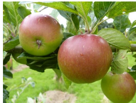
Figure 5 - Fiesta in August 2014

problems with wind damage (see below under "staking"). The trees with vigorous but whippy growth (i.e. more like plum) have done well and cope with wind better. Examples are Laxton's Superb, Duke of Devonshire and Dabinett. The Newton Wonder is supposed to be vigorous, but mine isn't. For some reason the Lane's Prince Albert did very well at first. This is not supposed to be a vigorous tree, but mine grew well and fruited early too! (see Figure 6).