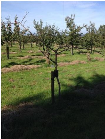
Figure 8 - Dead Lane's Prince Albert (2015)

Deciding that Radio 4 alone was probably an insufficient deterrent, I put plastic mesh fences 4ft high around every tree. This seemed easier, cheaper and less ugly than putting a big fence round the whole orchard and also meant that I could do away with the rabbit guards. There hasn't been any further damage from animals, but the fences bring their own problems in that the trees rub against them and damage the bark. If I'd put the stakes in vertically, then this would have been easily dealt with.