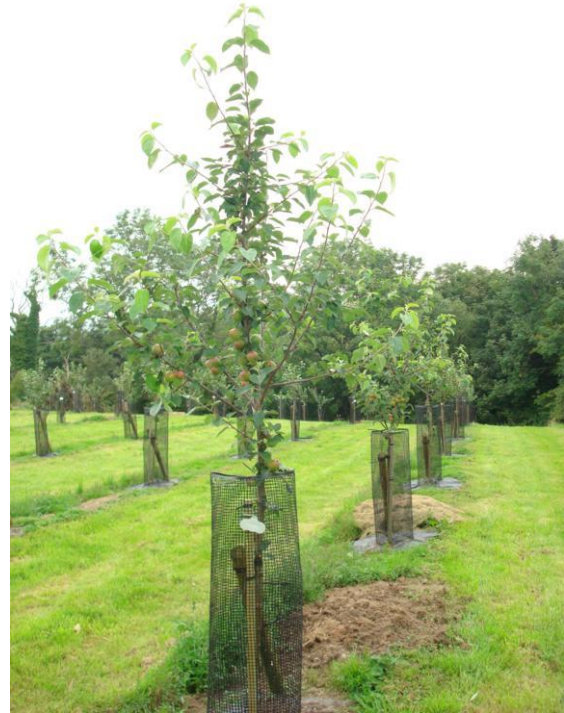
Figure 10 - Dabinett cider apple tree in 2010 with central leader (and quite a few fruit).

I have experimented with the “nicking and notching” approach. Having derided books on pruning, I think that this is best described in an old book I have: “Fruit Growing – Modern Cultural Methods” edited by N.B. Bagenal of East Malling Research Station. This book's first impression was in 1939 – I have the 1945 “war economy standard” edition, which is finer than many of today's books and cost then a princely sum of 30/- (about £150 now, relative to average earnings). For £10 in a Hay bookshop, I reckon it was good value! Generally it is an excellent book, although a bit out of date in its recommended use of lead arsenate etc. (it also mentions a new wonder chemical – DDT – that will be available after the war and may largely replace many existing sprays, being “non-poisonous, safe and pleasant to use, and unlikely to cause spray damage”.)